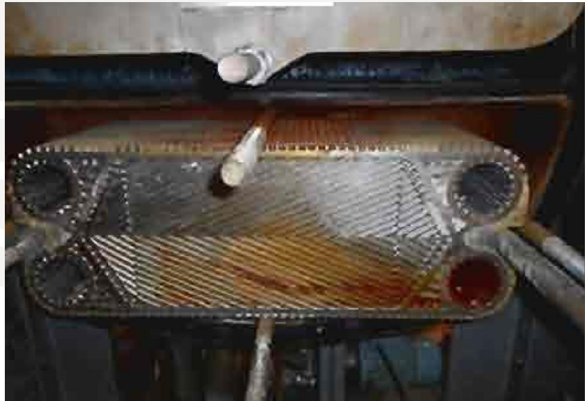
Figure 4. FWG plates on inspection date – June 26, 2015

The FWG was opened for inspection on June 26, 2015 ( After 18 months ) although water production was not reduced (20.5 mt/day). The