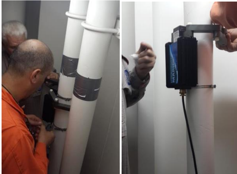
Figure 3. Installation location