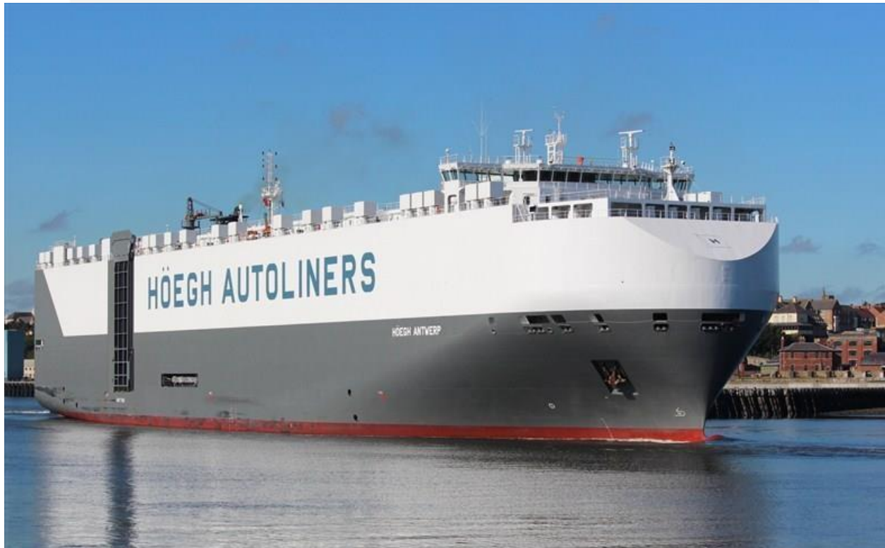
Figure 1. M/V Hoegh Antwerp